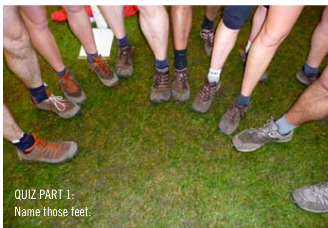
QUIZ PART 1: Name those feet.

Remember most of your runs are 80% mental and 20% physical, so think you can and you will but think you can't and you won't – GOOD LUCK !