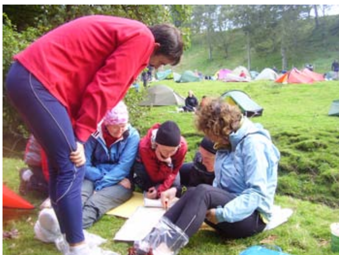
Day 1 finishes at 3pm, leaving only 6 hours to talk about routes, weather, blisters, cake and whether your dry socks have got wet yet

Finally .. it might only be 2nd place .. but it feels great ! .. we are Mountain Marathoners ! .. and we can scarcely believe it !