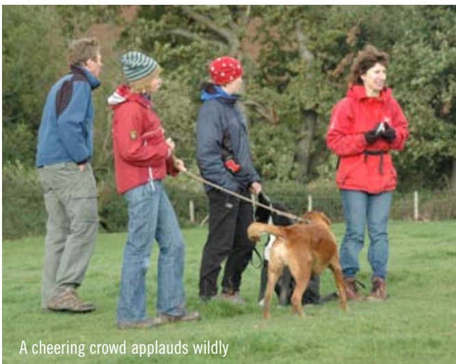
A cheering crowd applauds wildly