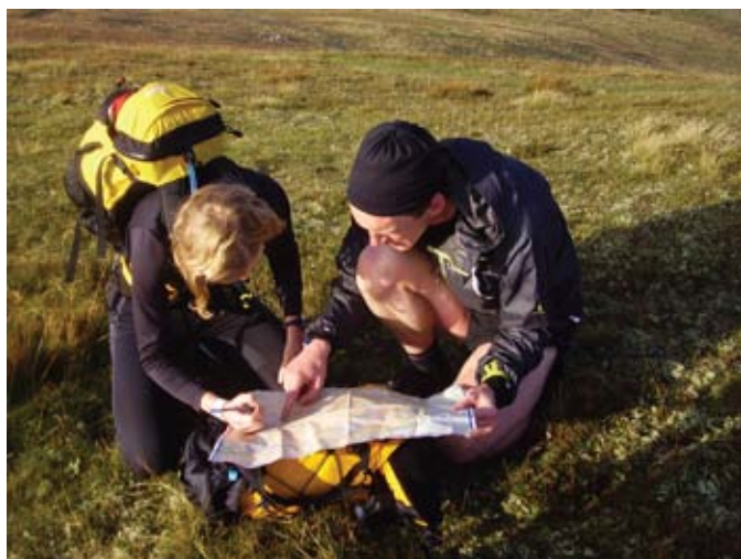
Next time, take a pen that works

So, are they any good? The score course element was my favourite part of the event, as it required a great deal