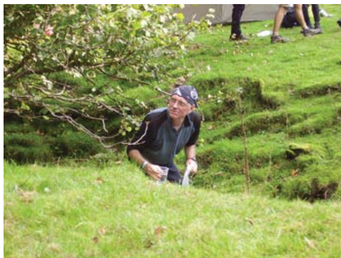
and a big ziploc bag for collecting water. And get there before Dave.