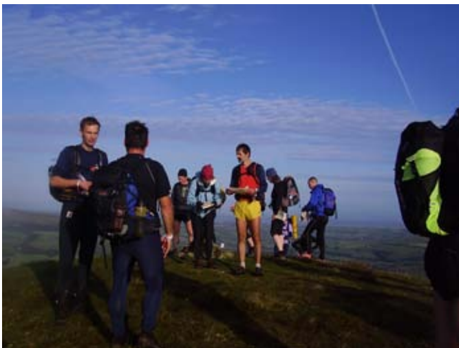
The morning of day 2, in which our heroes discover that dew is the coldest substance known to man and that coffee bags are rubbish.